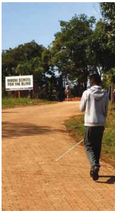
Ready to leave the school gates.

And then, there is the blind child who has left her school gates for the last time. And she feels equal to the new challenges that the big world out there will bring her. She can find her way round a college campus or help her father in his spaza shop.